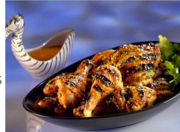
Bourbon Molasses BBQ Beans