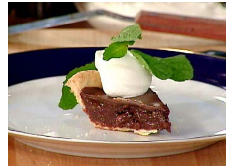
Georgia Pecan Pie