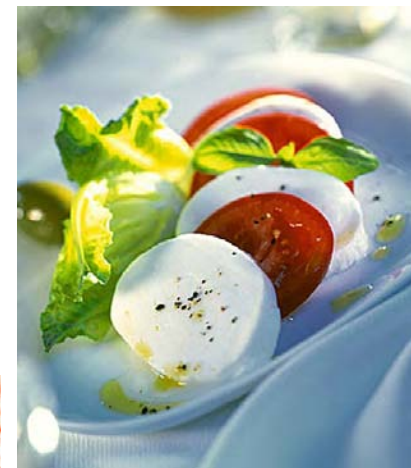
Tomato & Mozzarella with Basil