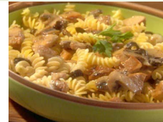
Penne with Fresh Garden Vegetables