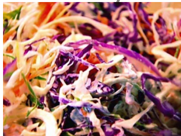
Southern Confetti Cole Slaw